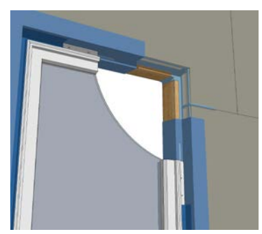
Diagram # 1

Install the window and/or door with a bead of BEP Blue Barrier Joint Filler behind the flange. (If the installation is not on the same day, the installer must wipe down the original coating with an approved solvent, as listed on the BEP Technical Data Sheet, to remove dirt and debris between coats.) Once the window or door unit is installed and after the required inspection, the installer must clean and scuff the nail/installation fin and the portion of any waxed or painted frame on the window or door unit to be coated. Apply a coat of BEP Blue Barrier Liquid Flashing at 12 mils from the corner of wood frame to cover the scuffed fin and the frame of the unit making sure to cover any gap between the fin and the frame. See Diagram #1 .